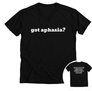
V-Neck Unisex Tee $28.49