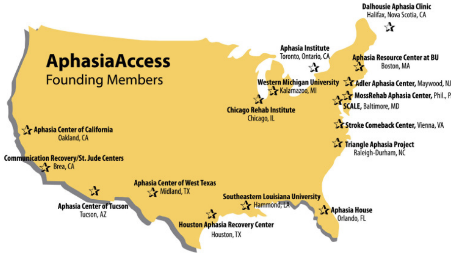
The founding members of Aphasia Access include Aphasia Centers from coast to coast.