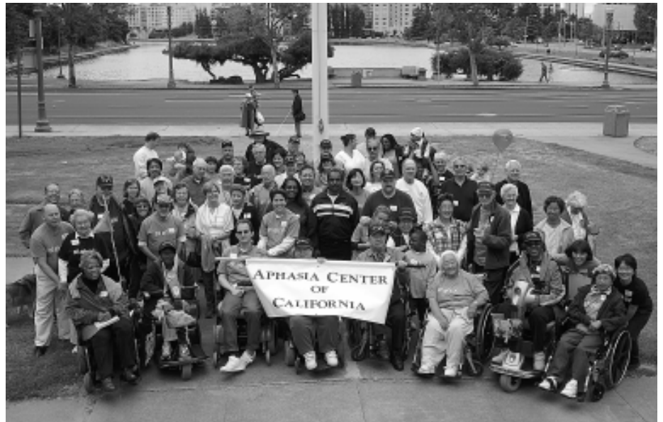
ACC supporters gathered at Lake Merritt on June 25th

We strolled and rolled together as a large group for a quarter of a mile along the shores of Lake Merritt. Following the entire group stroll with our Center banner, more than 20 participants decided to walk or roll around the entire 3½ miles of lake