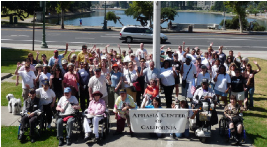
2009 Walk to Talk participants assemble at Lake Merritt as the Walk begins

More than 100 people joined us at Lake Merritt on Saturday, June 27th, for the Aphasia Center of California's 7 th annual "Walk to Talk." The event raised more than $26,000 to support program services at the ACC.