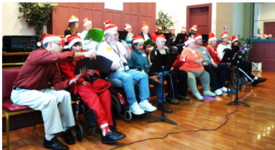
The ACC's KeyStrokes Choir at their Holiday Party Performance.